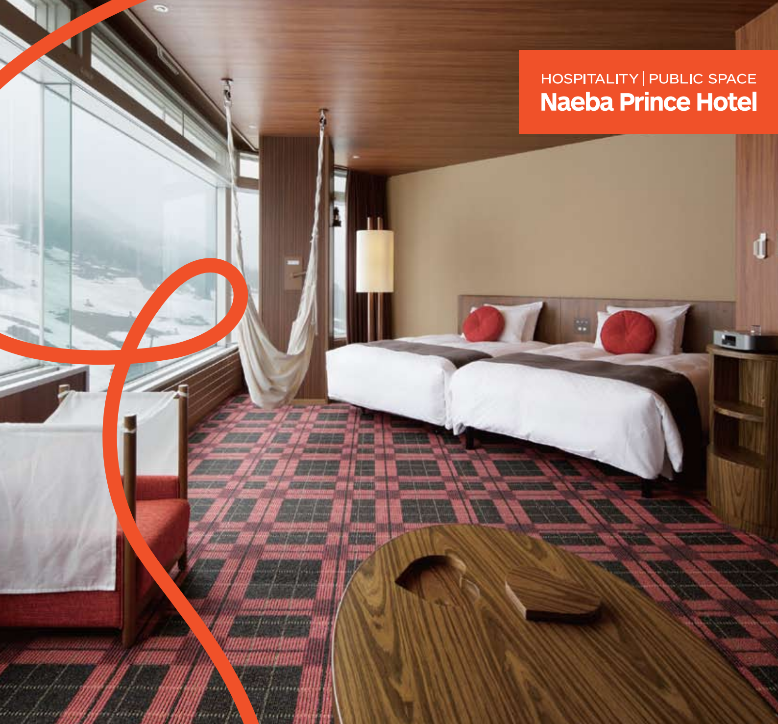
Kawashima Selkon Textiles Co., Ltd. Custom-design carpet